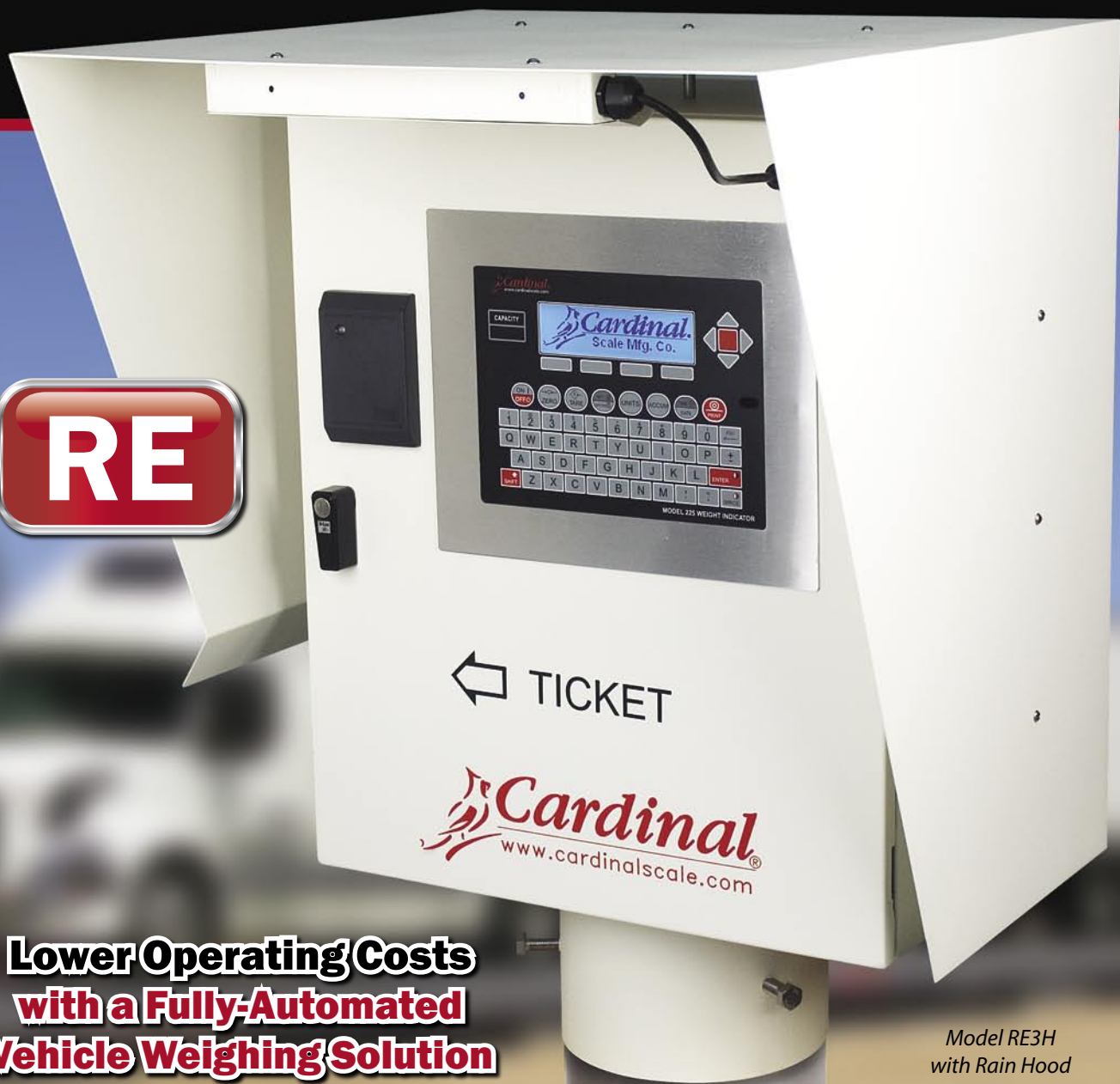
Model RE3H with Rain Hood

Lower Operating Costs with a Fully-Automated Vehicle Weighing Solution